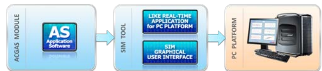
ACG for AS

The ACG for Application Software is the EICASLAB feature aiming at generating in ANSI C language the AS of the designed control algorithm, optimised in order to be easily integrated with any Basic Software. This feature requires the ACGAS module.