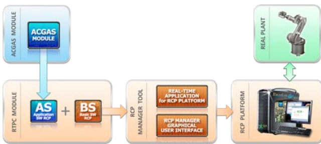
ACG for RCP

In order to configure the ACG for RCP, EICASLAB allows to provide a set of properties for correctly performing the overall RCP activity. A description of the RTPC module is provided in the brochure "EICASLAB RCP".